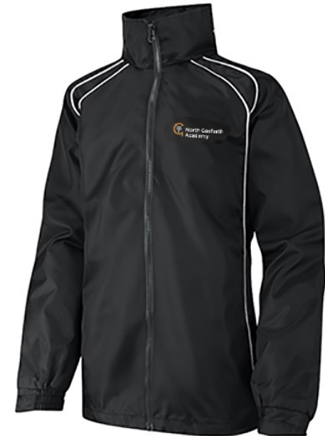
North Gosforth Academy Rain Coat with Badge Suitable to wear with fleece*