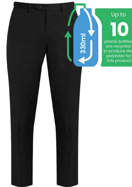
Boys Slimbridge Slim Fit Trousers

Junior Sizes: 22/18 – 28/20 Senior Sizes: 30/18 – 40/22