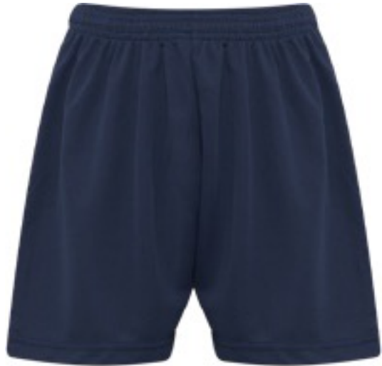
Plain Navy or Black Sports Shorts

These items may be purchased from Michael Sehgal's or other retailers