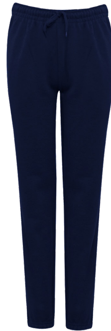
Plain Navy or Black Training Pants

Junior Sizes: 22/24" – 26/28" Senior Sizes: 28/30" – 42"