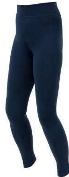
Plain Navy Sports Leggings

Junior Sizes: 22/24" – 26/28" Senior Sizes: 28/30" – 42"