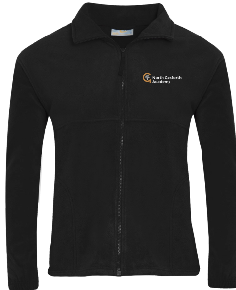
North Gosforth Academy Outdoor Micro Fleece Jacket with badge Suitable to wear with rain coat*