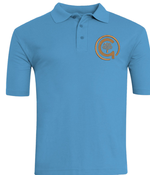
North Gosforth Academy PE Polo with badge