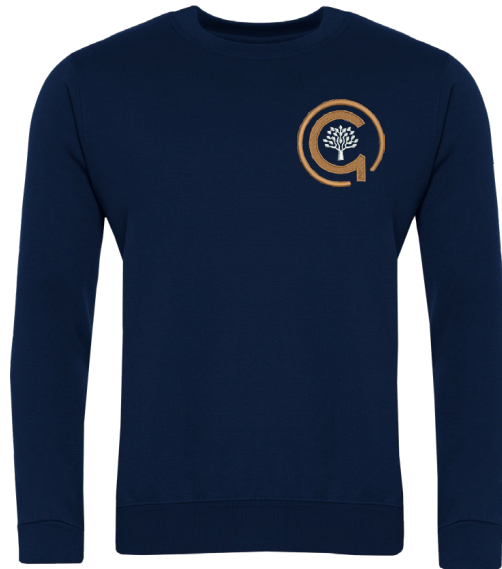
North Gosforth Academy Day Sweatshirt with badge