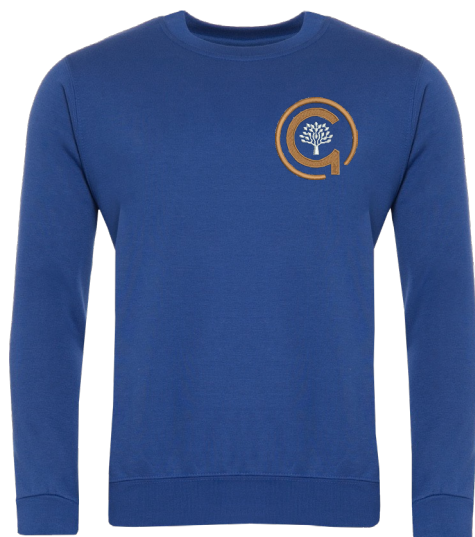
North Gosforth Academy PE Sweatshirt with badge