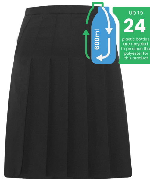
Designer Pleated Skirt