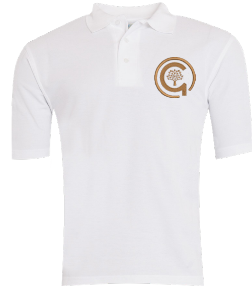
North Gosforth Academy Day Polo Shirt with badge